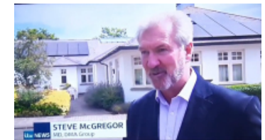
ITV News Meridian interviewed DMA's group managing director